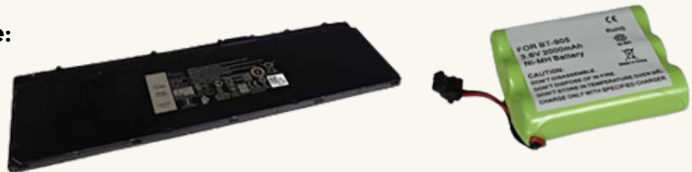
Pictured: A green Nickel Metal Hydride battery pack, and a black lithium-ion battery.

These three types of batteries are rechargeable , which typically can be brought to a retail location, such as Lowe's, Staples, and Home Depot at no charge. If these batteries are put into your recycling or garbage bins, they can cause fires harming our Sanitation team and equipment!