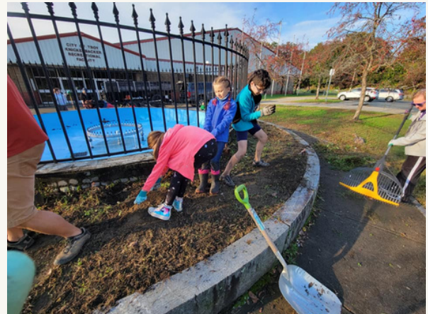
Pictured: Girl Scouts from troop 1165 planting tulip bulbs at Knickerbacker Park.