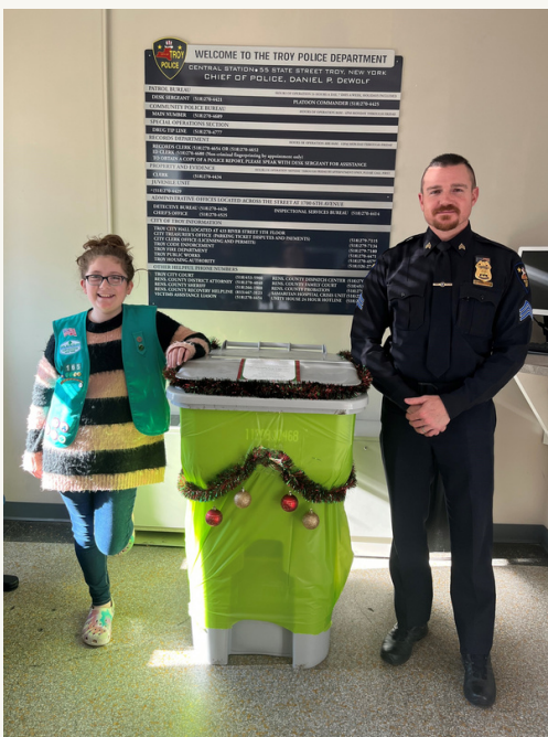
Pictured: A Girl Scout drops off a decorated barrel to the Troy Police Department.