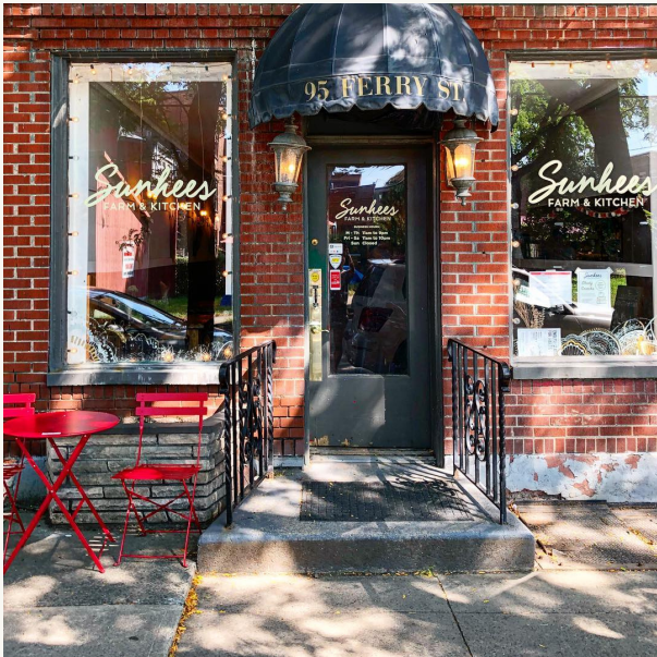
Pictured: Front door to Sunhee's Farm and Kitchen.

Located on Ferry Street in Downtown Troy, Sunhee's Farm and Kitchen makes sure their leftover food scraps have a destiny other than the landfill.