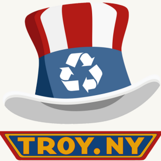
Pictured: logo for CleanupTroy app; Uncle Sam's hat with recycling symbol and the TROY, NY logo.

TO ALL TROY RESIDENTS WITH MUNICIPAL COLLECTION SERVICES: we have an app! Search 'CleanupTroy' in the app store to download it for your iOS or Android device.