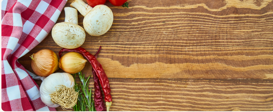
Pictured: picnic table with gingham cloth and assorted produce.