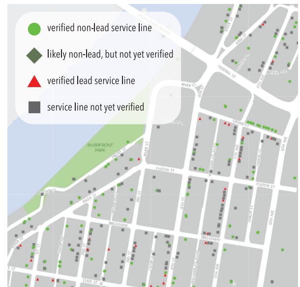
Interactive map that can be viewed on troyny.gov/lead

If you haven't done so already, please inventory your service line through troyny.gov/lead or by calling DPU at (518) 237-0343